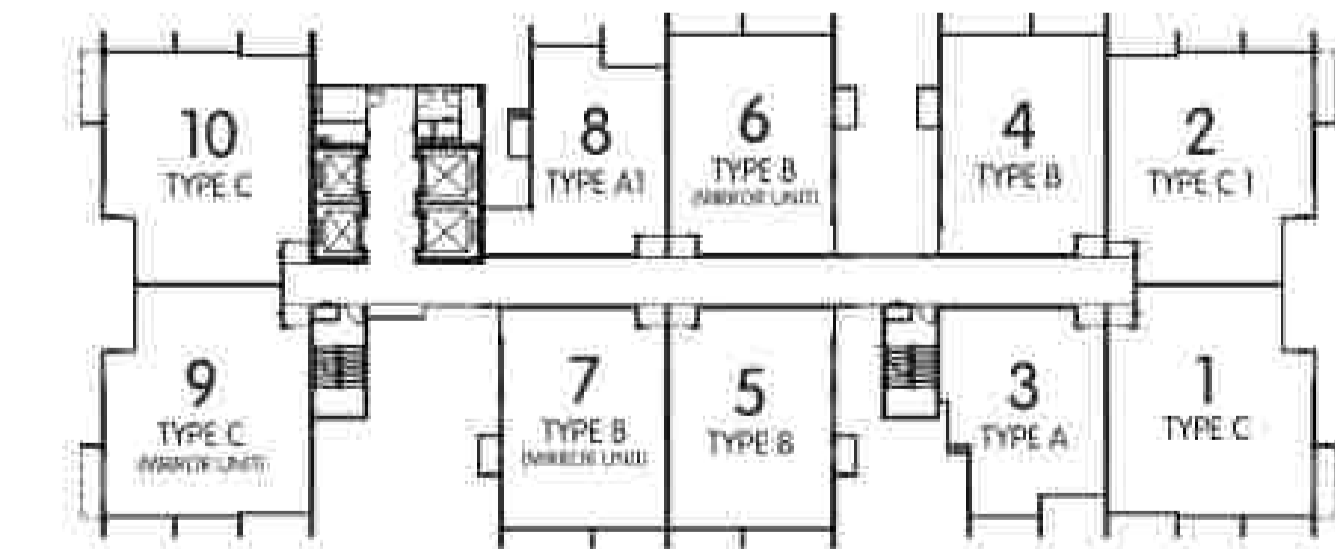
ARAS 8, 9, 10, 11, 12, 13, 14, 15, 17, 18, 19, 20, 21, 22, 23, 24, 25