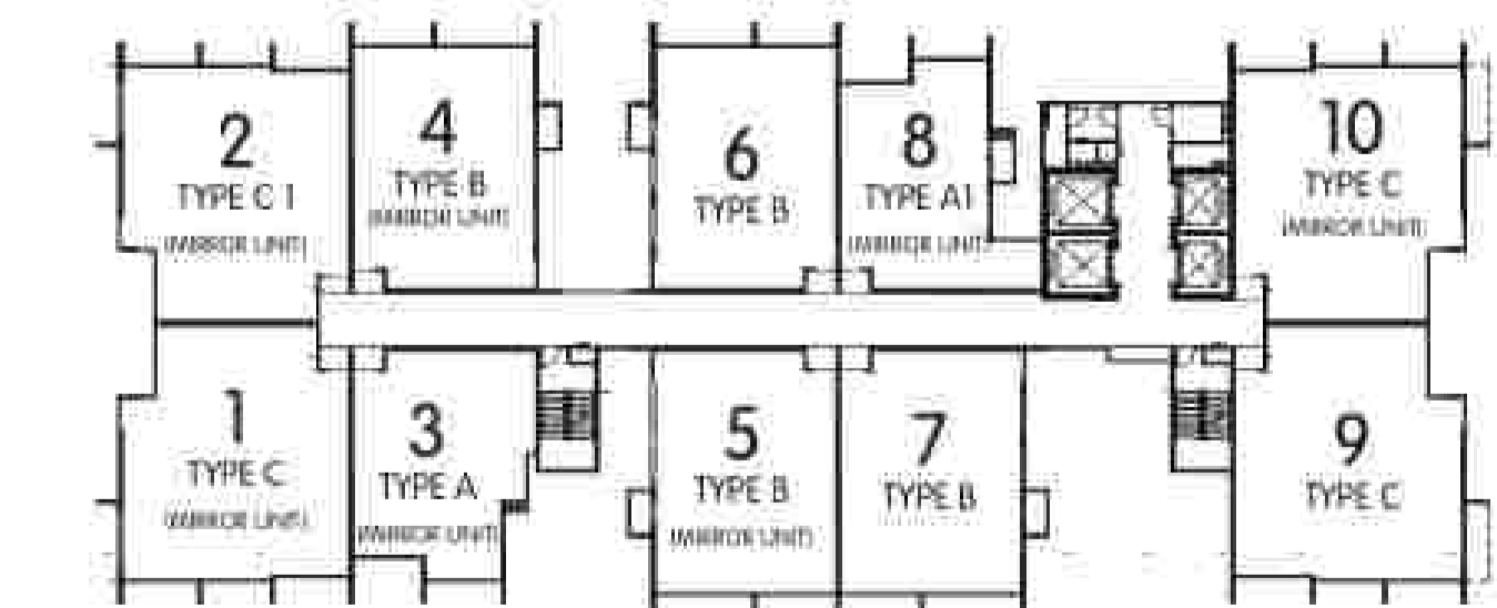
ARAS 8, 9, 10, 11, 12, 13, 14, 15, 17, 18, 19, 20, 21, 22, 23, 24, 25