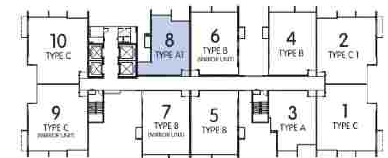
ARAS 8, 9, 10, 11, 12, 13, 14, 15, 17, 18, 19, 20, 21, 22, 23, 24, 25