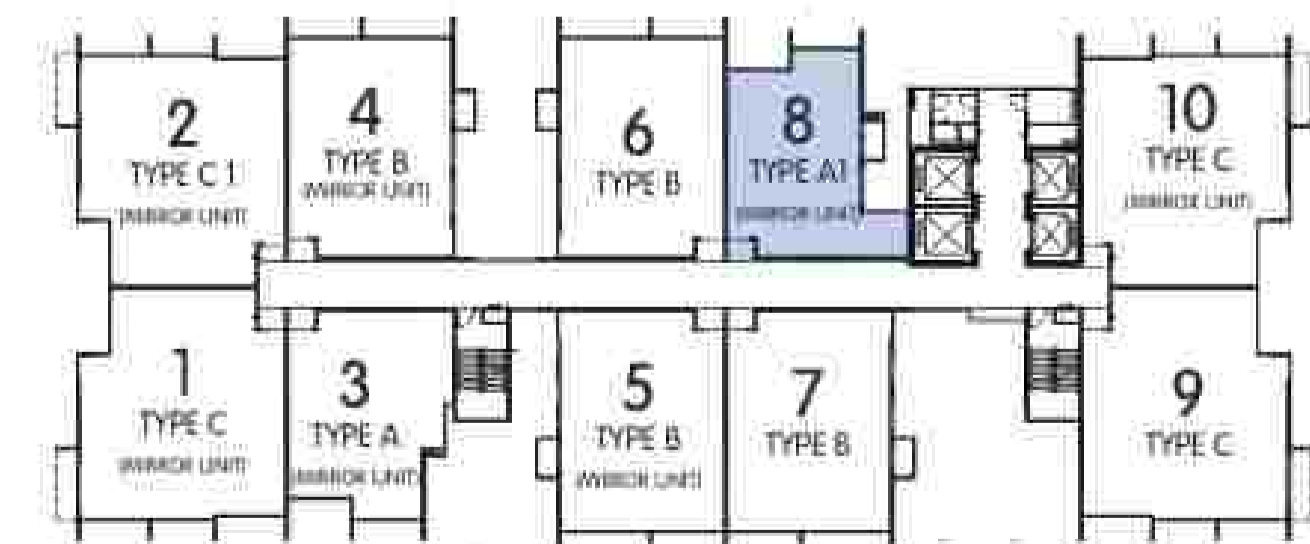
ARAS 8, 9, 10, 11, 12, 13, 14, 15, 17, 18, 19, 20, 21, 22, 23, 24, 25