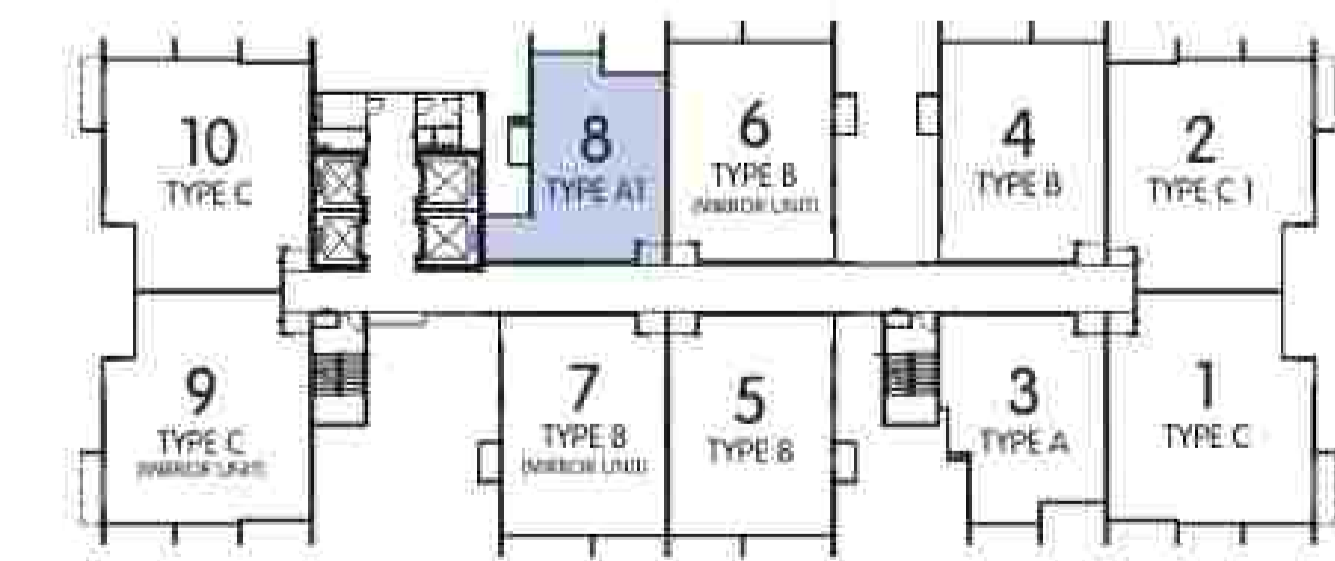
ARAS 8, 9, 10, 11, 12, 13, 14, 15, 17, 18, 19, 20, 21, 22, 23, 24, 25